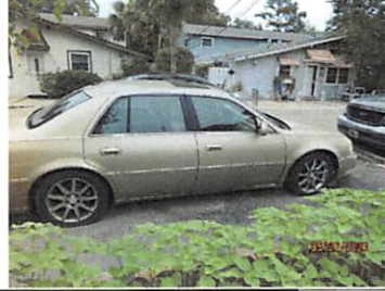
608-B 36 th Ave N