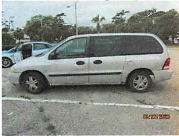
1805 N Kings Hwy