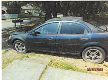
12 th Ave S Public Beach Access