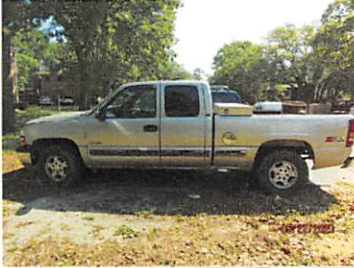
7201 Porcher Dr.