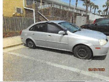
12 th Ave S Public Beach Access